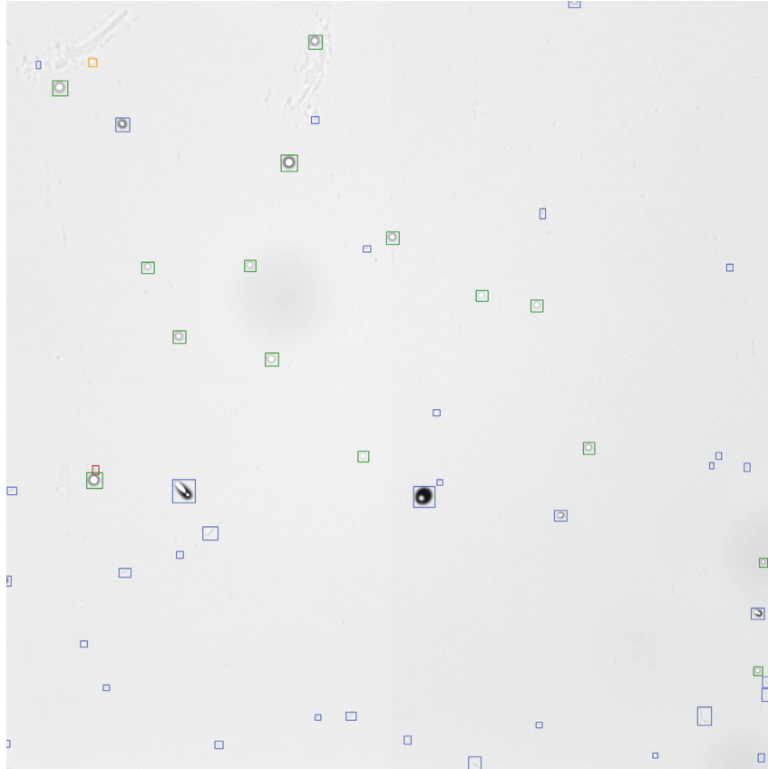
FIGURE 3: An example of FAINE tagging signs inside a CR-39 image. Green squares indicate true positives, blue squares indicate true negatives, red squares indicate false positives, and orange squares indicate false negatives.