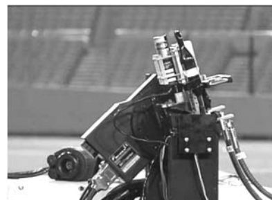
Fig. 2. Tracking system.