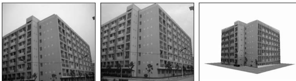
Fig. 3. Original images and the 3D reconstruction model.