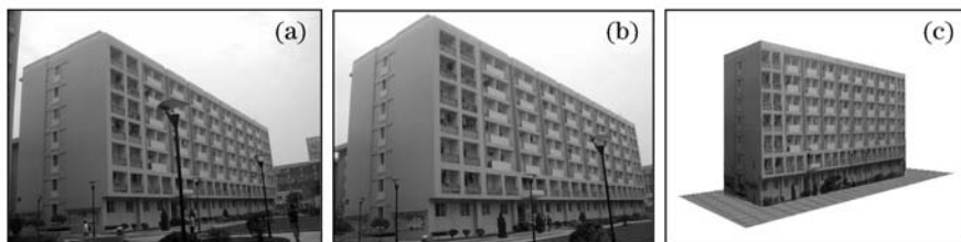
Fig. 1. (a) Original image a, (b) original image b, (c) 3D reconstruction model.

Figure 3 is another 3D reconstruction example. This model has five textured planes, and the angle of two 3D reconstructed planes is 91.6^\circ , it is very close to the orthogonal angle.